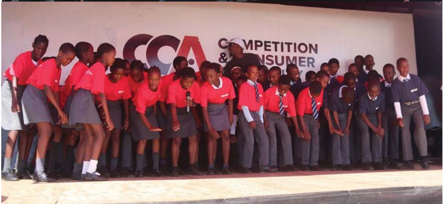
Commemoration of World Consumer Rights Day at Lentsweletau