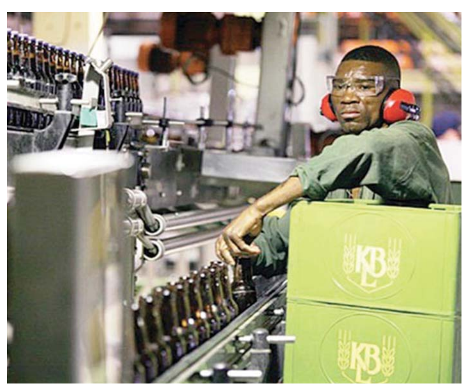
An employee at the Kgalagadi Breweries Limited (KBL) plant in Gaborone, Botswana

Taking the public interest concern into account, and pursuant to the provisions of section 55 of the Competition Act, the Authority approved the proposed acquisition with the conditions that: The merged entity shall use all its endeavours to ensure that the manufacturing business of KBL is maintained instead of turning it into a distribution point for imported products; and that in the event that the merged entity is compelled to change the business model into a distribution point, such inten-