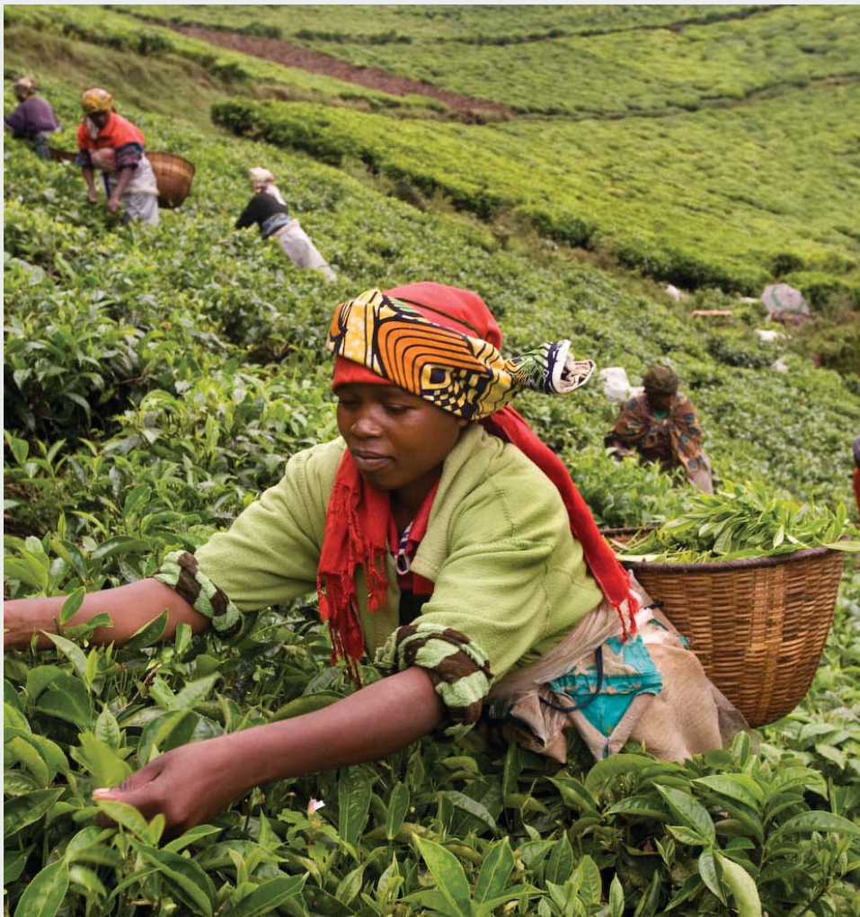
Rwanda Tea harvest

"There have been a notable number of countries adopting competition laws in Africa, and this bodes well for growth and development. However, while the benefits of competition are already clearly observable in Africa, there is still considerable effort required to ensure effective implementation of competition laws and policies across the continent. Collaboration among competition authorities in Africa, bilaterally and through the Africa Competition Forum, and with development partners is key to facilitate capacity building of younger authorities, systematise information on